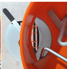
Extra wide chute