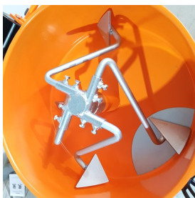
Four mixing arms and paddles